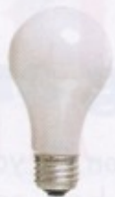
basic light bulb