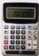
pile of receipts, calculator