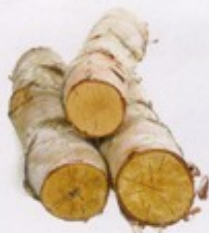
stack of logs